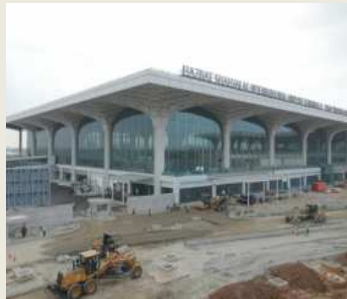
DHAKA HAZRAT SHAHJALAL INTERNATIONAL AIRPORT 3RD TERMINAL PROJECT