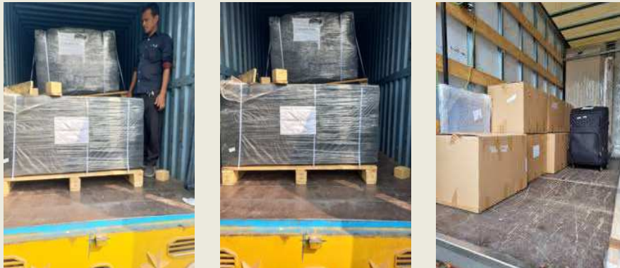
DIPLOMATIC PROJECT HANDLING